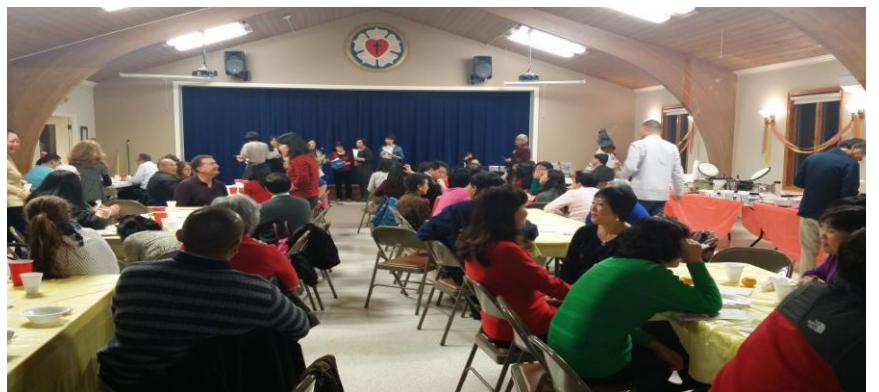
橙郡华人教会感恩节餐聚: 体验喜乐, 感恩与分享