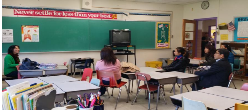
OCCS Teacher/Parent Conference - Nov 22, 2014